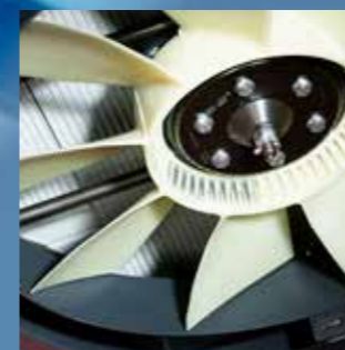
A EU Stage IIIB / EPA Tier 4i emissions compliant diesel engine, improved electronics and the new cooling system boost truck uptime.

The Kalmar DCG90-180 offers you the choice of new EU Stage IIIB / EPA Tier 4i emissions compliant diesel engines. From Volvo and Cummins, both cut particulate emissions by 90% as well as reduce nitrogen oxide emissions in half.