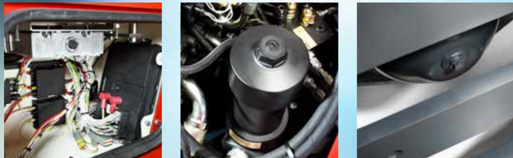
Service is fast, simple and convenient thanks to improved accessibility and smart features, like the hydraulic filters (middle) and a plug for filling shaft oil while standing (right).

Service intervals for the 9-18 tonne range are after 500 hours of operations. This long service interval meets top industry performance parameters. As important, Cargotec's global presence means we can provide the right level of local support to your maintenance teams.